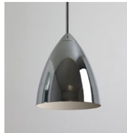
CODE: 1223019 FINISH: POLISHED CHROME

TO MAINTAIN THIS PRODUCT TO ITS BEST CONDITION, PLEASE VIEW OUR CARE AND CLEANING GUIDE ON THE SUPPORT SECTION OF THE ASTRO WEBSITE.