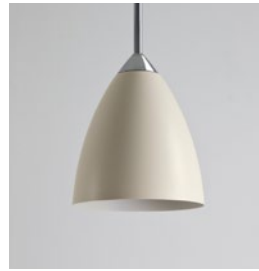
CODE: 1223017 FINISH: CREAM