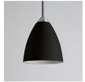
CODE: 1223018 FINISH: MATT BLACK